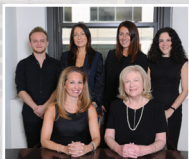
Burger & Green, LLP