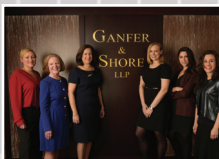
Ganfer & Shore, LLP

A Special Advertising Section presented by