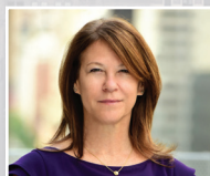
Rosenberg & Estis, P.C.