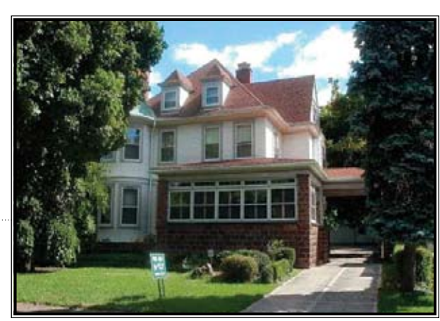
BUFFALO, NEW YORK FOUR-BEDROOM, THREE-BATH HOUSE. $449,000. AGENT: GURNEY BECKER & BOURNE.