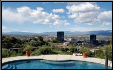
LOS ANGELES, CALIFORNIA FOUR-BEDROOM, THREE-BATH HOUSE IN THE HOLLYWOOD HILLS. $1.67 MILLION. AGENT: JIM SHOGREN, SOTHEBY'S INTERNATIONAL REALTY.