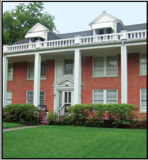
HOUSTON, TEXAS 10,549-SQUARE-FOOT HOUSE IN MONTROSE (CURRENTLY DIVIDED INTO FIVE APARTMENTS). $1.679 MILLION. AGENT: TIM SURRETT, GREENWOOD KING PROPERTIES.