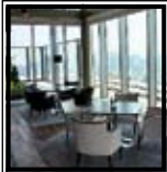
TOKYO, JAPAN TWO-BEDROOM CONDO IN AKASAKA. ¥160 MILLION. AGENT: PLAZA HOMES, LTD.