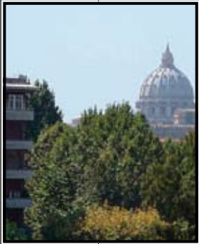
ROME, ITALY FOUR-BEDROOM, TWO-BATH CONDO IN PRATI. €1.32 MILLION. AGENT: VIVIUM INTERNATIONAL PROPERTY LISTINGS.